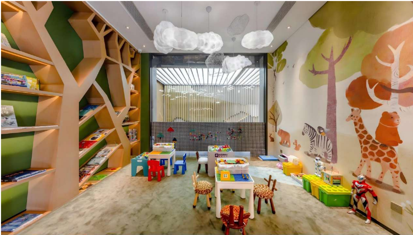
Open and Nature-Connected Children's Play Area Offers a variety of activities for children and families