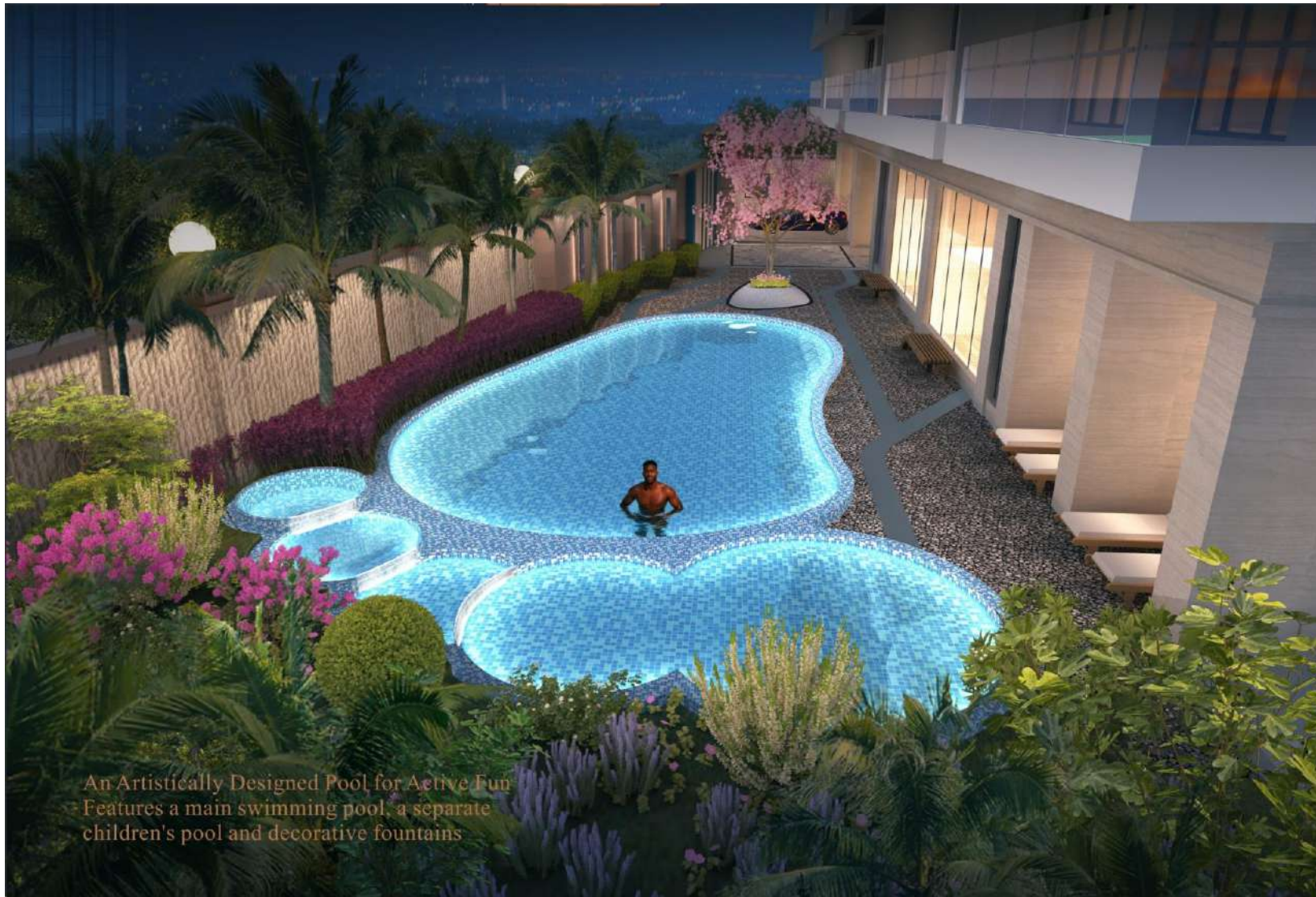
An Artistically Designed Pool for Active Fun Features a main swimming pool, a separate children's pool and decorative fountains