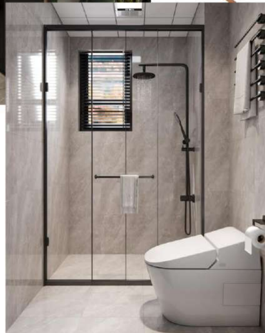
Spacious and Bright Bathroom