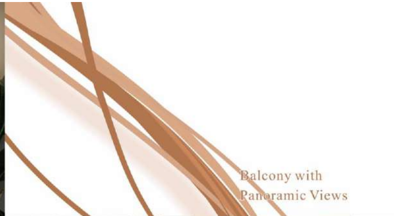
Balcony with Panoramic Views