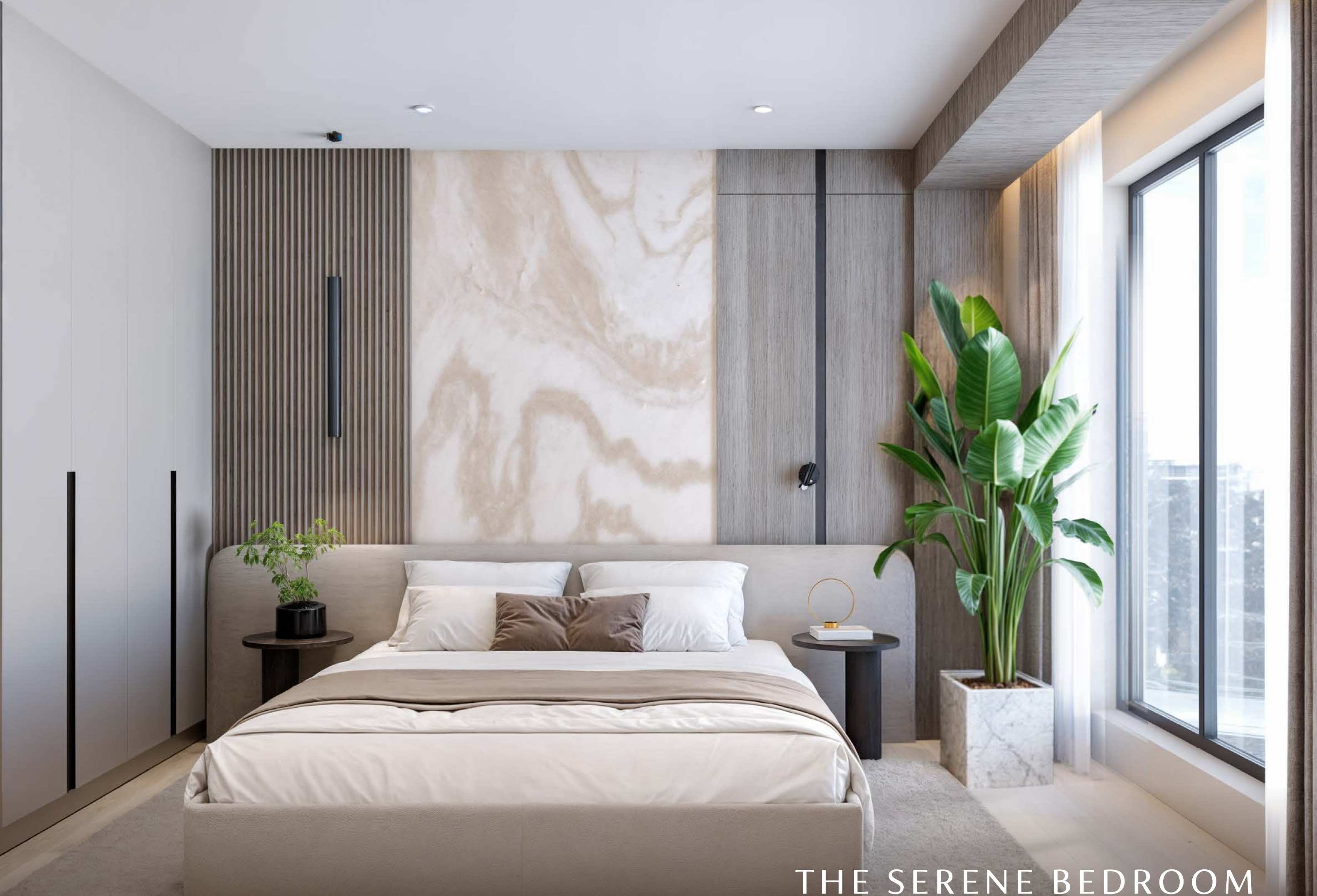
THE SERENE BEDROOM