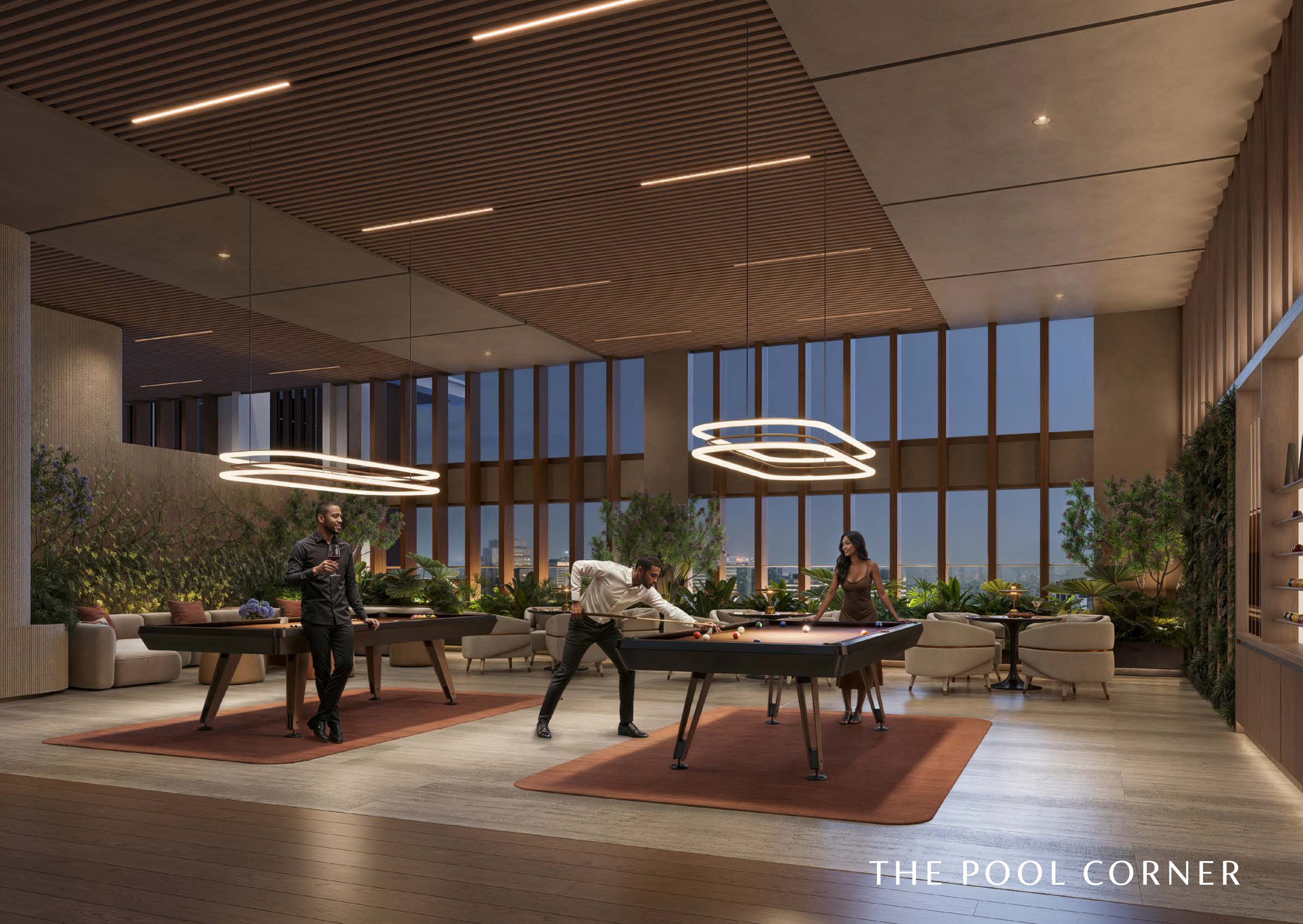
THE POOL CORNER