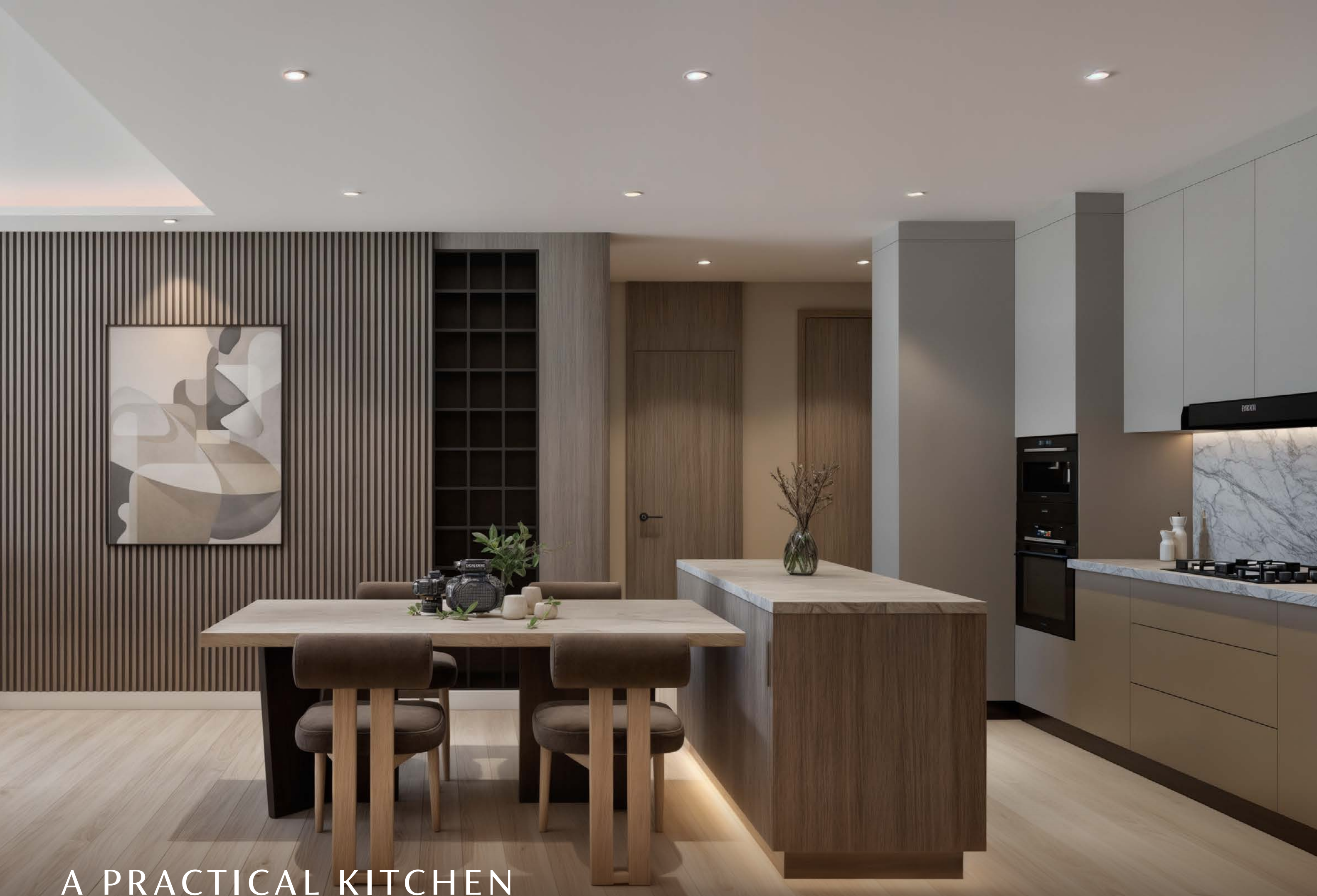
A PRACTICAL KITCHEN