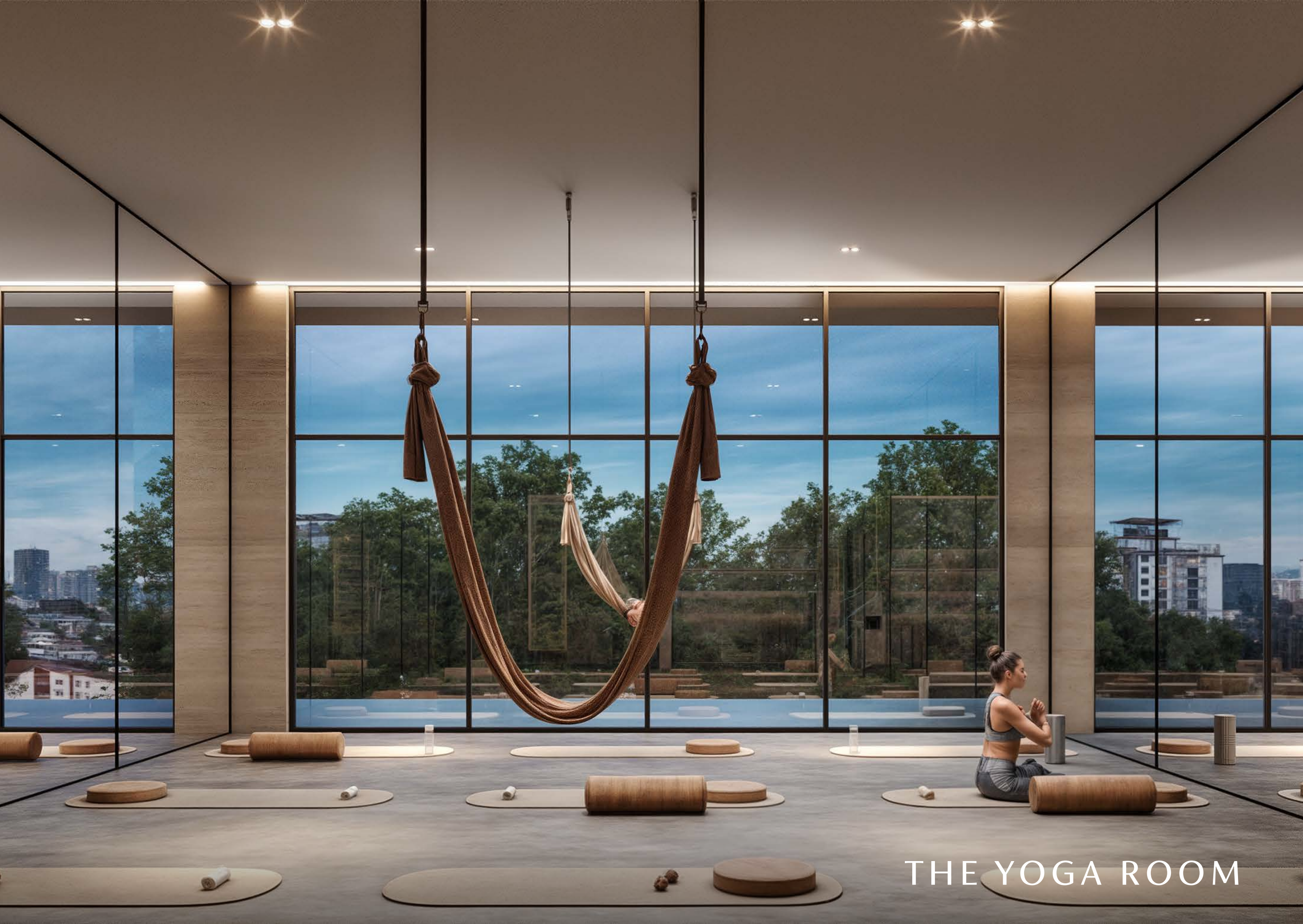
THE YOGA ROOM