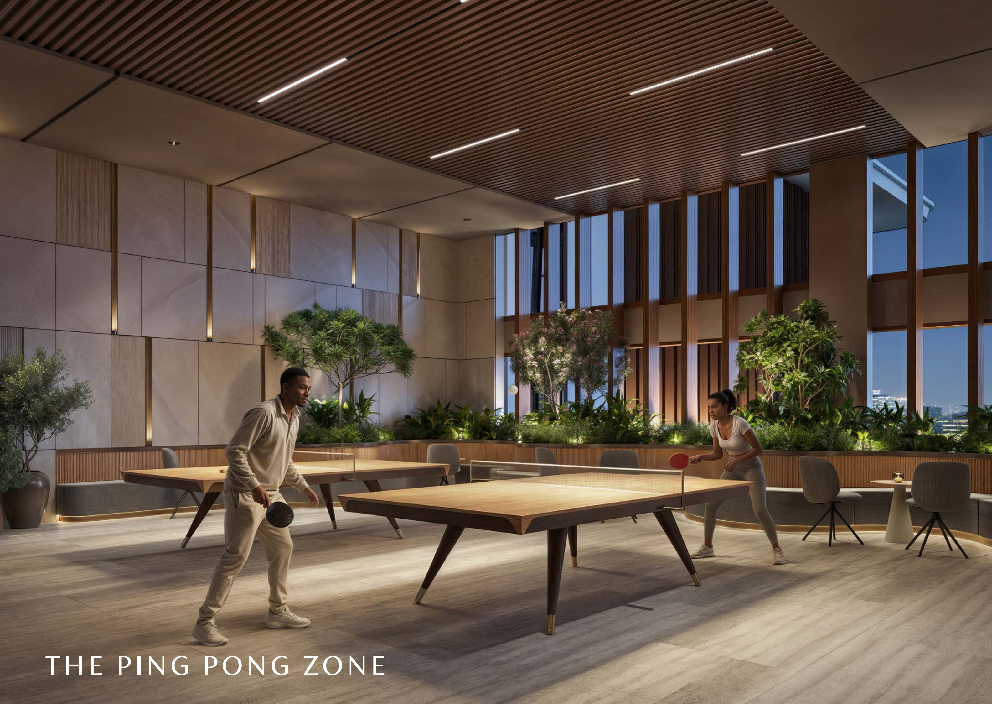
THE PING PONG ZONE