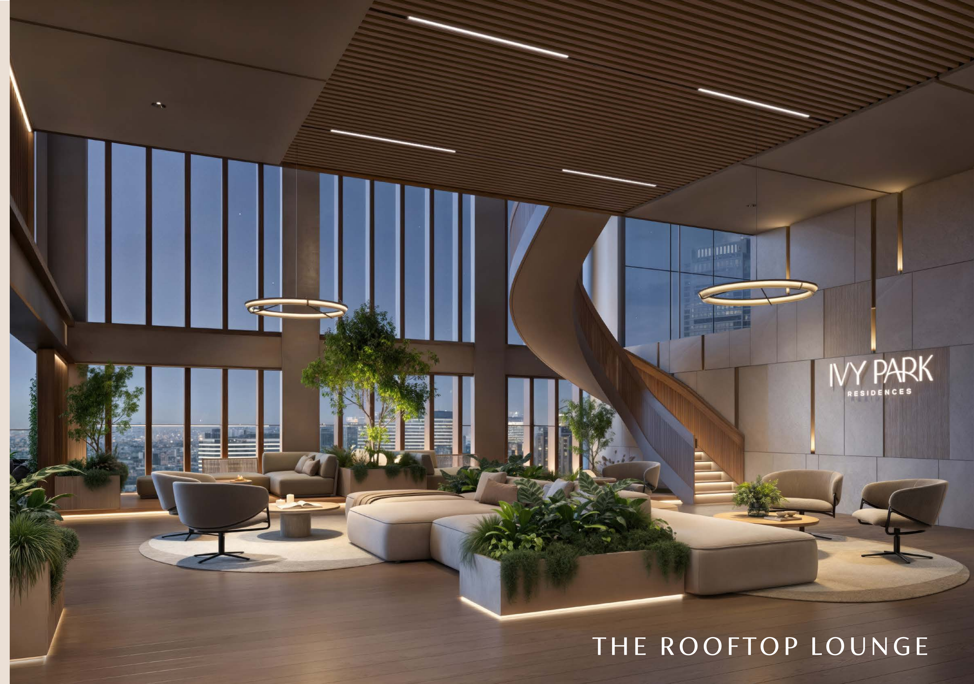
THE ROOFTOP LOUNGE

The lower rooftop level brings together comfort, activity, and calm in one open space. From the lounge and bar to the games and garden areas, every corner is designed to be used, not just admired. It's a place where residents can unwind after work, host friends, or spend a quiet afternoon with a view. This level adds everyday value by creating more ways to live, relax, and connect, right at home