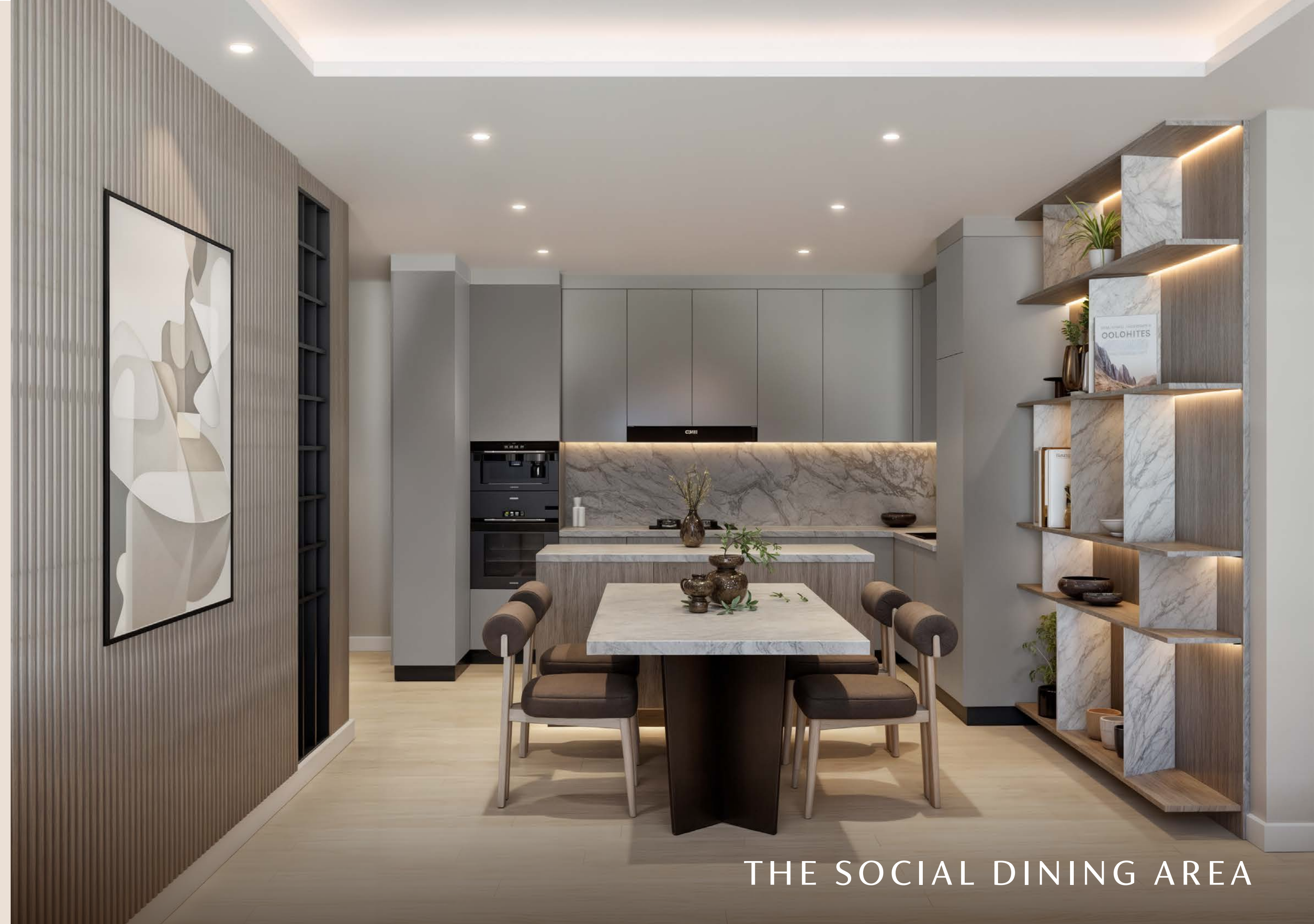
THE SOCIAL DINING AREA

The interiors at Ivy Park combine warm tones, natural textures, and streamlined finishes to create a calm, modern atmosphere. Large windows open up the spaces with natural light, while open-plan living and dining areas give flexibility for both everyday routines and entertaining. Every room is designed to feel simple, uncluttered, and easy to make your own.